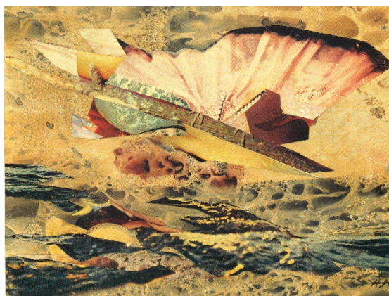
09 Hannah Höch Fata Morgana , 1957 Collage 21,2 x 28,2 cm Private collection © 2023, ProLitteris, Zurich

All copyrights are reserved. The complete caption must be used and the artwork reproduced as illustrated. It is only permitted to reproduce the images in conjunction with coverage of the exhibition Hannah Höch. Assembled Worlds .