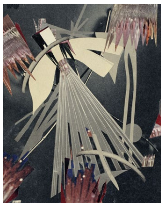
10 Hannah Höch Friedensengel [Angel of Peace], um 1958 Collage on cardboard 22,2 x 17,5 cm Berlinsche Galerie – Landesmuseum für Moderne Kunst, Fotografie und Architektur / Repro: Kai-Annett Becker / Berlinsche Galerie © 2023, ProLitteris, Zurich