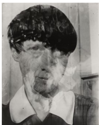
12 Untitled (Hannah Höch. Double-exposed portrait), n. d. Silver gelatine print 12 x 8,5 cm Berlinsche Galerie – Landesmuseum für Moderne Kunst, Fotografie und Architektur / Repro: Anja Elisabeth Witte/Berlinsche Galerie