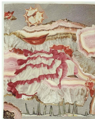
11 Hannah Höch Um einen Roten Mund [Around a Red Mouth], um 1967 Collage 20,5 x 16,5 cm Institut für Auslandsbeziehungen e. V., Stuttgart